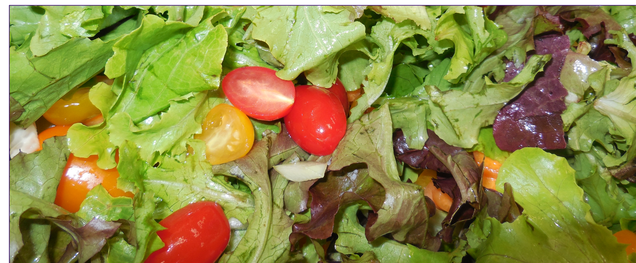
LOCAL PRODUCE FOR HEAD START LUNCH IN SPOKANE, WA