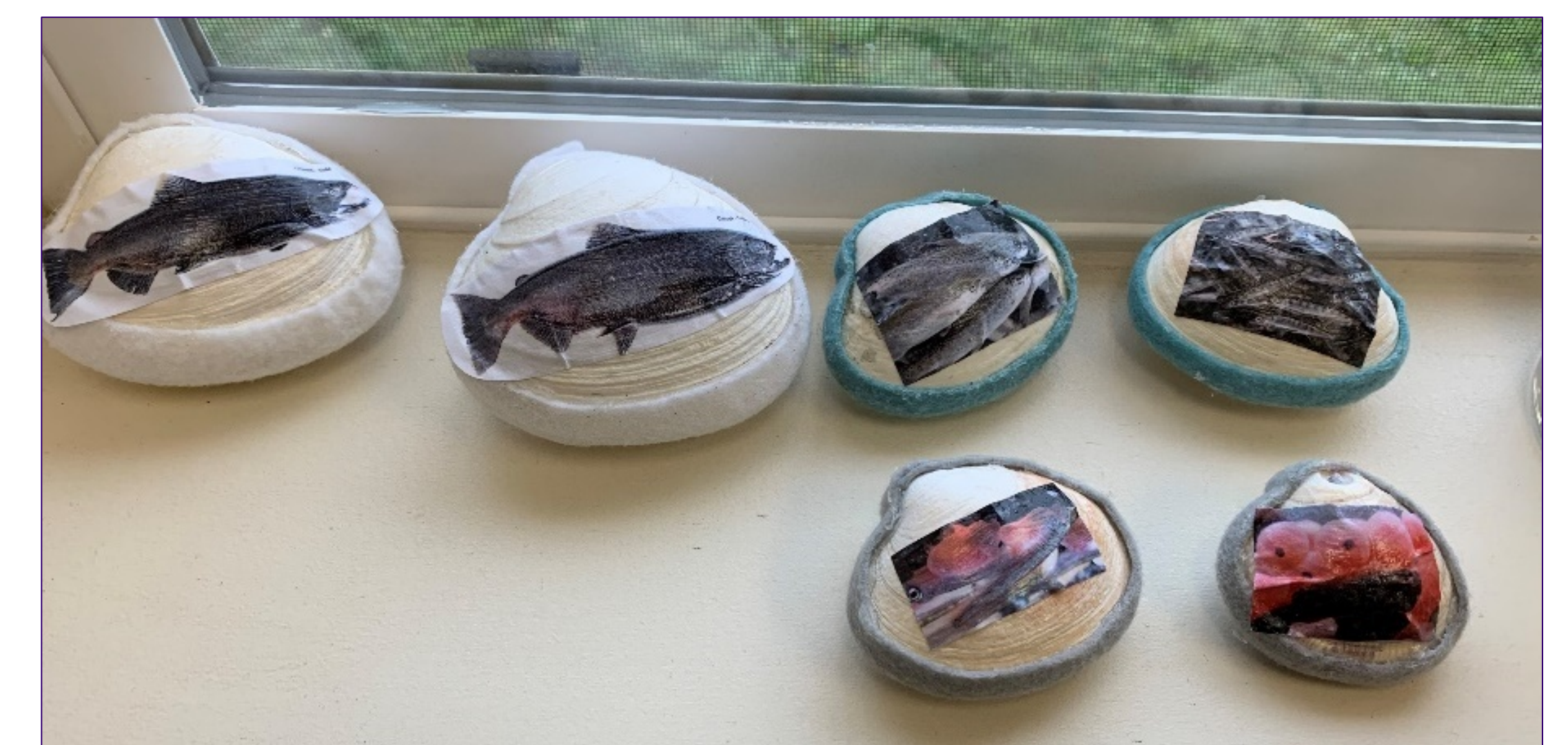
CLAMSHELL SHAKERS TEACH INFANTS ABOUT SALMON AT THE SUQUAMISH NATION'S EARLY LEARNING CENTER IN SUQUAMISH, WA