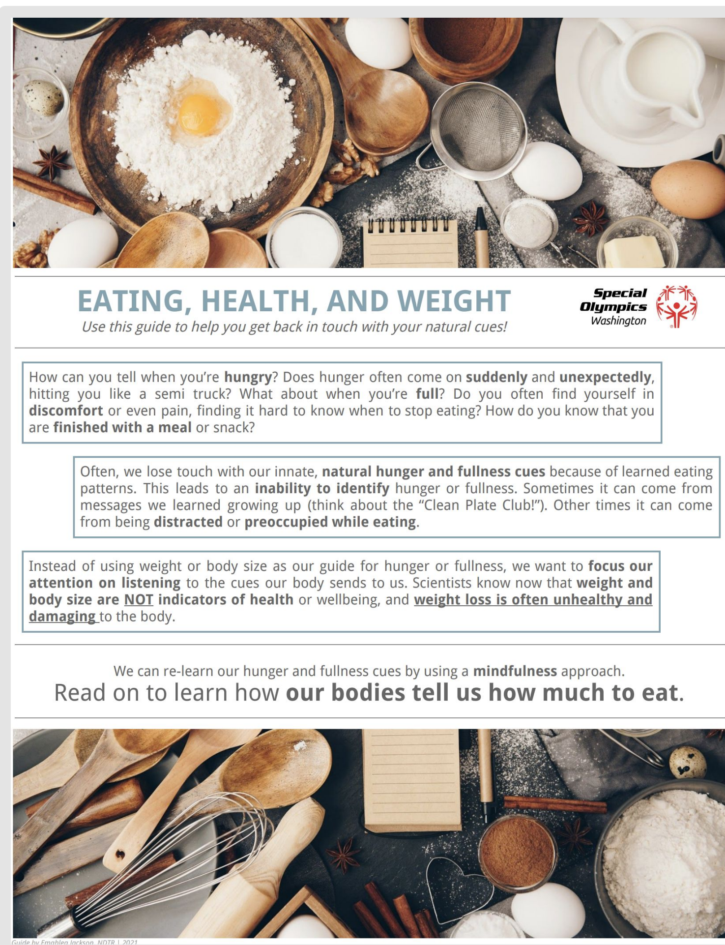
Example of weight-neutral handout for SOWA athletes.

How-to guide with integrated barrier prevention for eliminating regular weight measurements