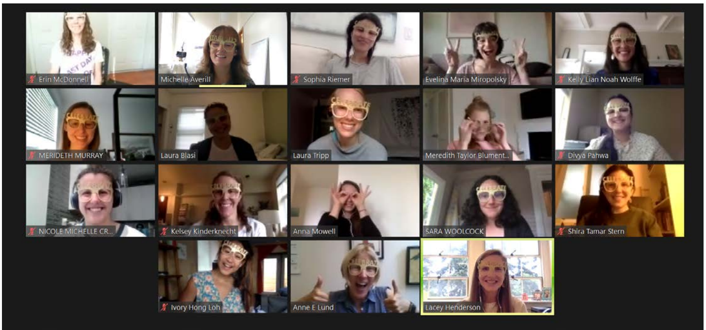
2020 graduates celebrating at our Zoom graduation

In this report, we share some of our 2020 cohort's achievements, list the previous degrees held by future cohorts, announce the 2020 Outstanding Preceptors, share recipients of the GCPD preceptor scholarship funds, highlight some of the speakers and events our 2020 interns participated in, provide program updates, and share ACEND updates.