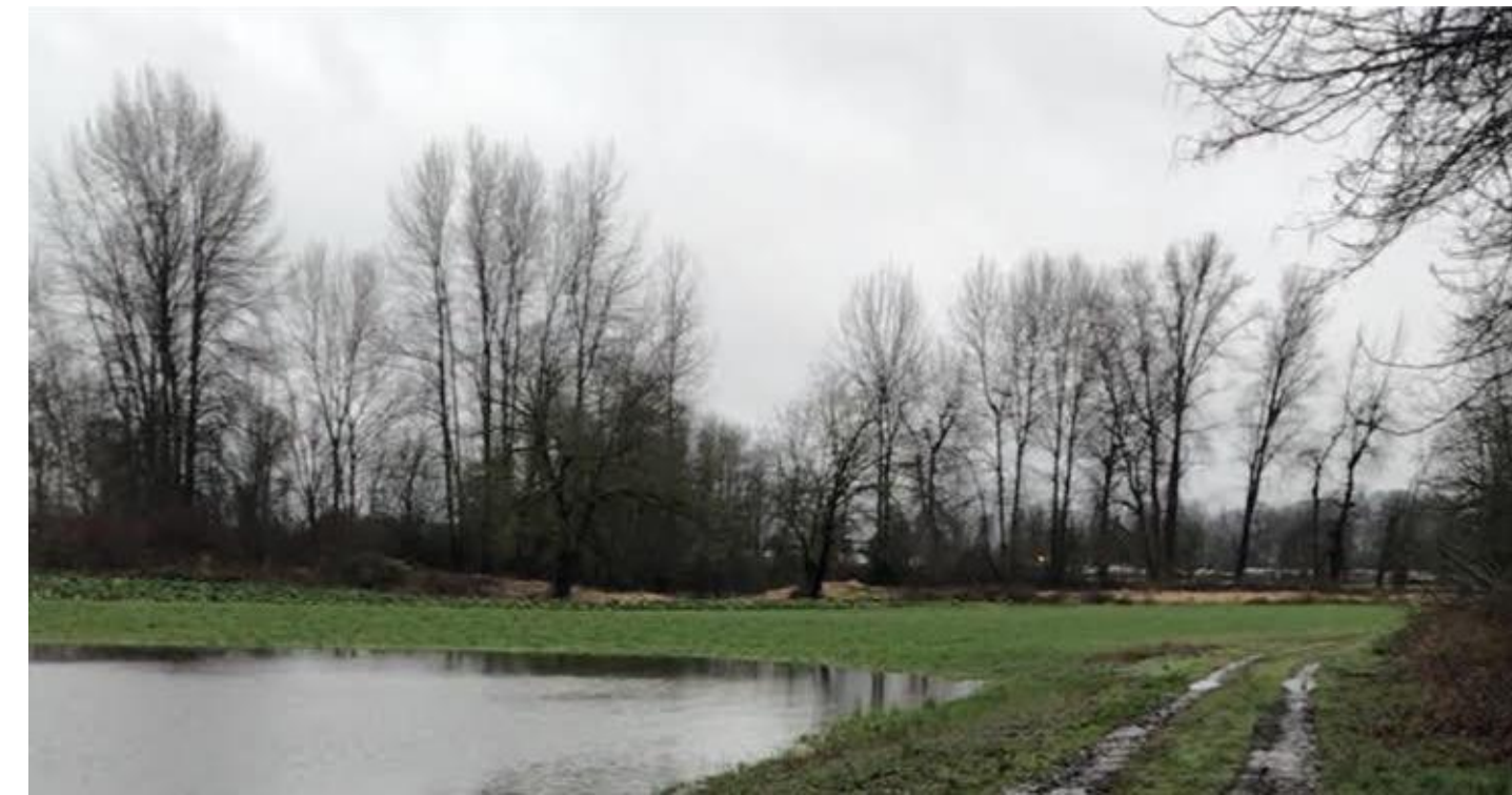
South King County's agricultural sites are subject to annual flooding. Flood patterns must be taken into consideration when determining the location of a physical food aggregation center.