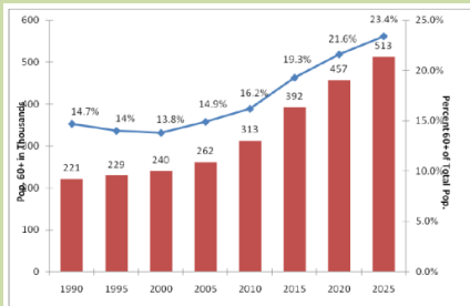
King County's 60+ Population, Number and Percent of Total Population (1)

MOW receives funding from the Older Americans Act (OAA), client donations and private donations. The recent economic decline has resulted in donation decreases and only sustained funding from the OAA. This decline has resulted in an over-subscription of meals that has left MOW service unsustainable. As the proportion of King County residents who are 60+ increase (see graph), an increase in demand for MOW service is expected.